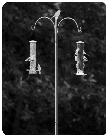
Advanced Pole System Hanging Hardware Basic Setup

With the right additions, your yard can be even more attractive to visiting birds.