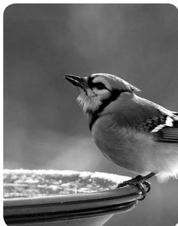
Blue Jay perched on a Wild Birds Unlimited Bird Bath

Bird Baths Birds need water to keep their feathers in top-flight condition and for good insulation on cool spring nights. Add a decorative bird bath that is bird-friendly. We carry a variety of ceramic, concrete and other styles.